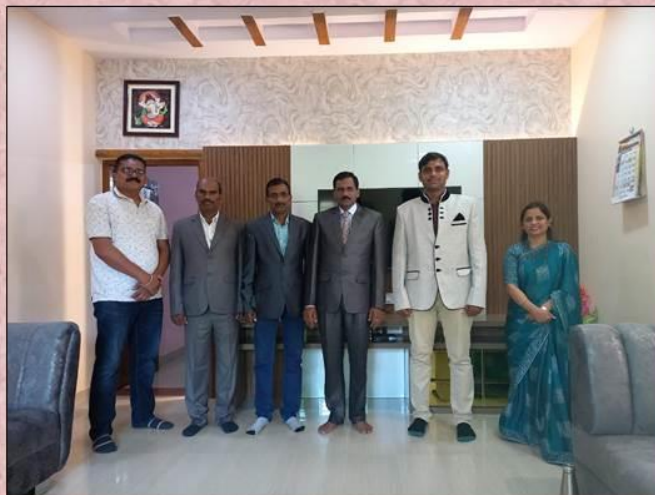
ORGANISING COMMITTEE MEMBERS