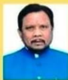
Hon'ble Dharmraobaba Atram Secretary BMSS, Aheri & MLA, Ex- Minister MS